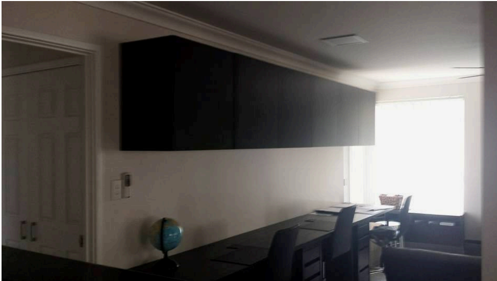
Figure 2: The family theatre converted to the multiple screen room – the southwest corner.